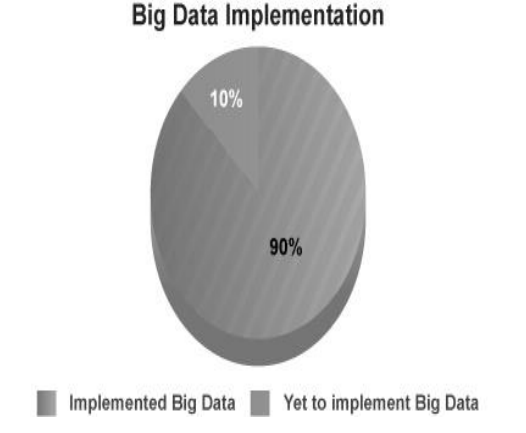
Figure 2: Implementation of Big Data in Markets

emerging global superpower, the need to create its own mark on the technological world is essential. As Facebook made its way into the hearts of Indian masses, the scope for new technology is emmense. And Hadoop is the next big thing! Following graph shows companies where Big Data is implemented.